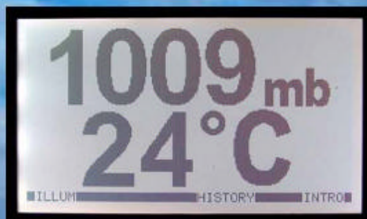
Barometric pressure and internal temperature